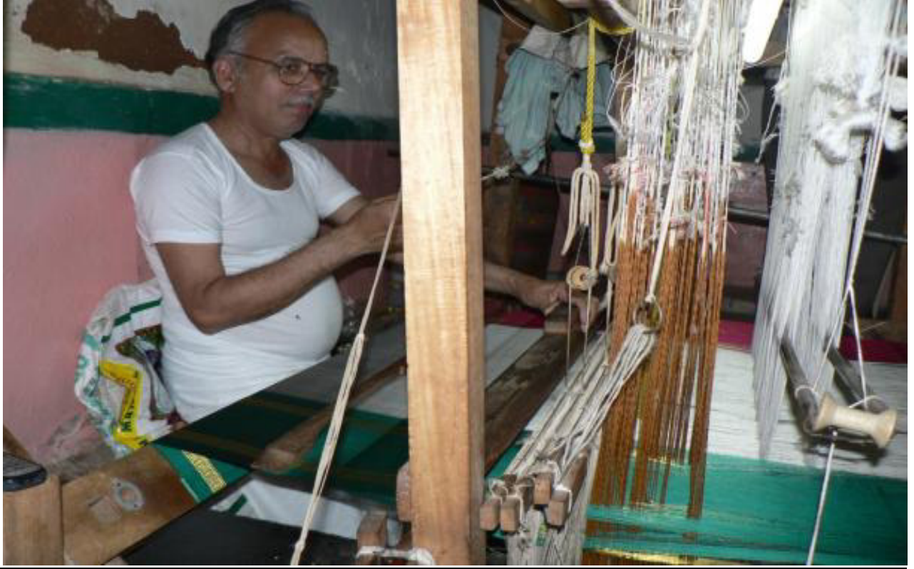
Molakalmur Kuttu saree on Pit loom